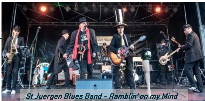
St Juergen Blues Band – Ramblin' on my Mind

If you would like to assist, email: hamiltonbluesnz@gmail.com with 'Fundraiser' in the subject line.