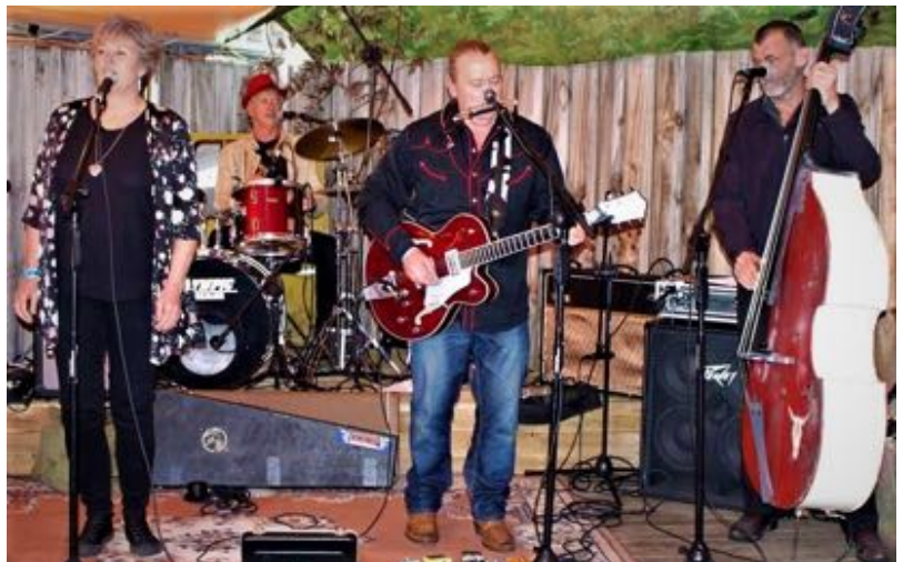
Performing at the Pirongia Blues Festival